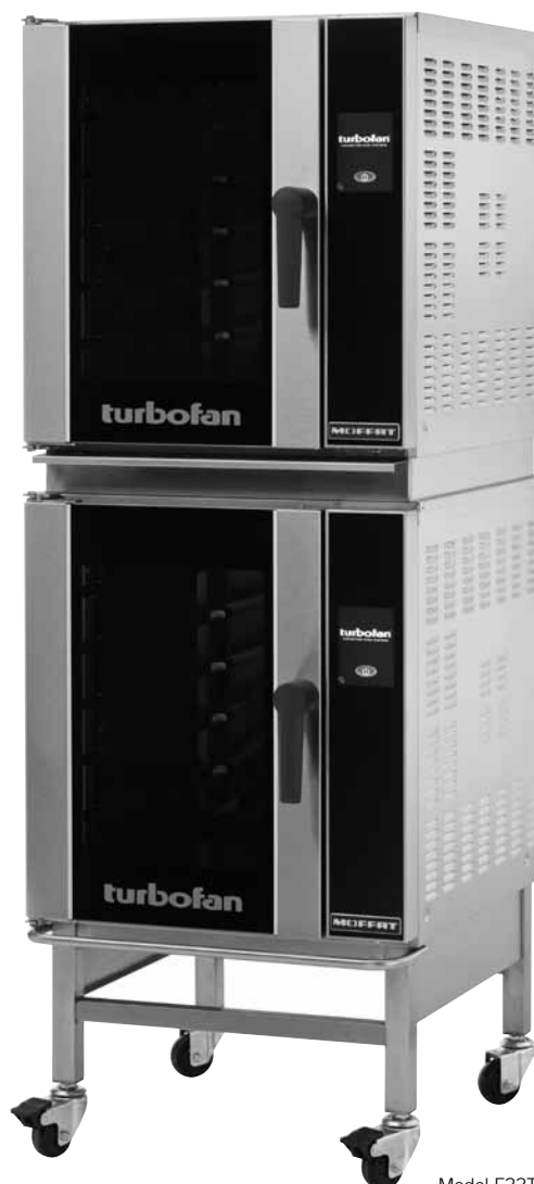
Model E33T5/2C shown