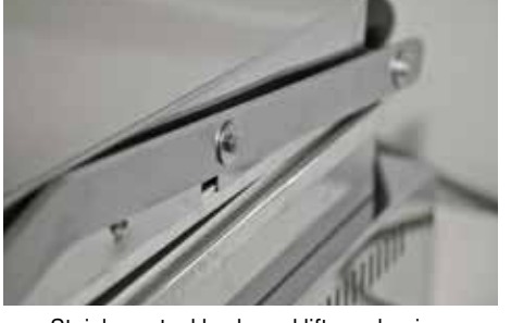
Stainless steel body and lift mechanism

Our perennial best sellers offer large and medium sized cooking platens.