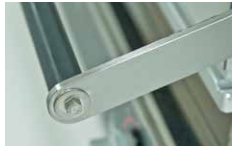
Insulated handle for added safety