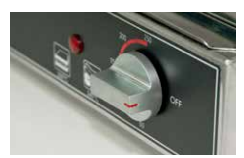
Thermostat control and pilot light