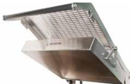
Protective heat shield and rigid handle