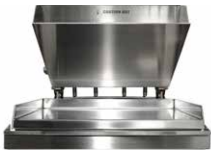
Smooth internal corners for easy cleaning