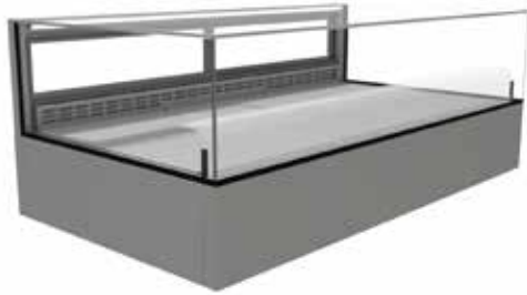
ACCL15 (square back option)