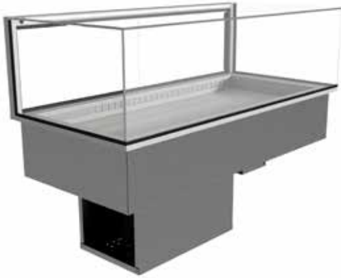
SCRW15 (Frameless Canopy and Rear Sliding Door options)