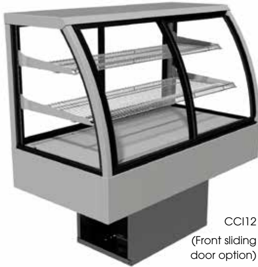
CCI12 (Front sliding door option)